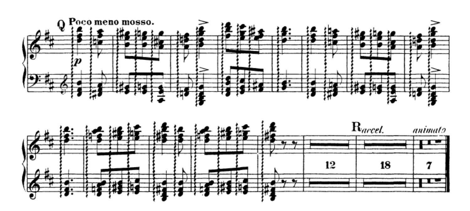
HARP Excerpt 1: N. Rimsky-Korsakov– Scheherazade Poco meno moso, Q to 13 before R