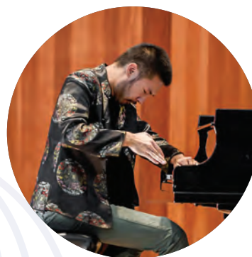
January 28/29 Mozart's Defiance: Piano Concerto No. 24