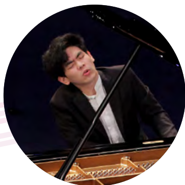
September 24/25 Mozart's Romantic Side: Piano Concerto No. 20