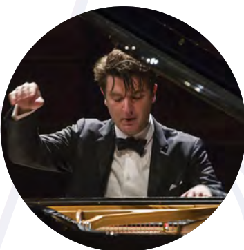
December 3/4 Mozart's Dream: Piano Concerto No. 21