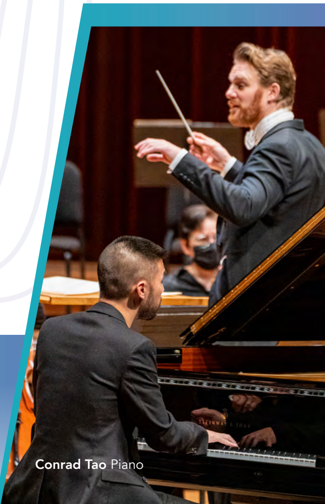
Conrad Tao Piano